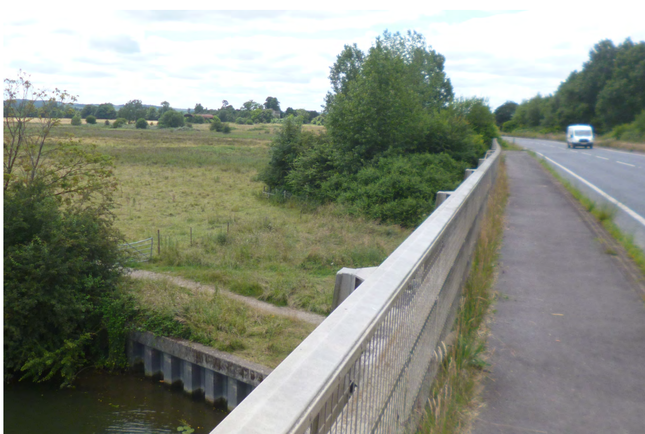
View from Winterbrook Bridge - Nosworthy Way (Wallingford Bypass)